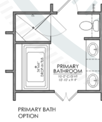
PRIMARY BATH OPTION